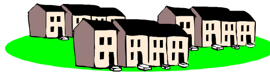
Growing thriving habitats

We're back now with renewed enthusiasm for Habitat and we feel we now understand a bit better about why we are here."